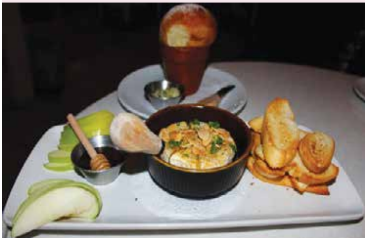
Baked Brie Shareable Plate, a rich and creamy brie round, with tart green apple slices, honey, almonds, and baked crostini along with Flower Pot Bread

Queenstown Village is a fantastic spot to enjoy a relaxed meal with great food, friendly service, and a welcoming atmosphere. Whether you're stopping by for brunch, dinner, or drinks, there's something for everyone. For more information on Queenstown Village, visit their website at q-town.com.