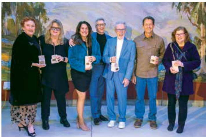
The 2024 Art Star Awards Winners. Photo by Ryan Hill