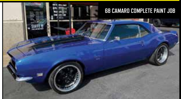
68 CAMARO COMPLETE PAINT JOB